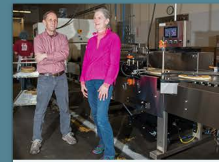
FOOD & BEVERAGE PRODUCTION & HOSPITALITY