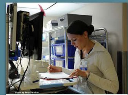
HEALTHCARE & SERVICES