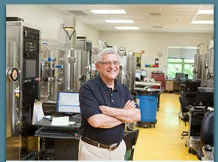
VALUES @ WORK