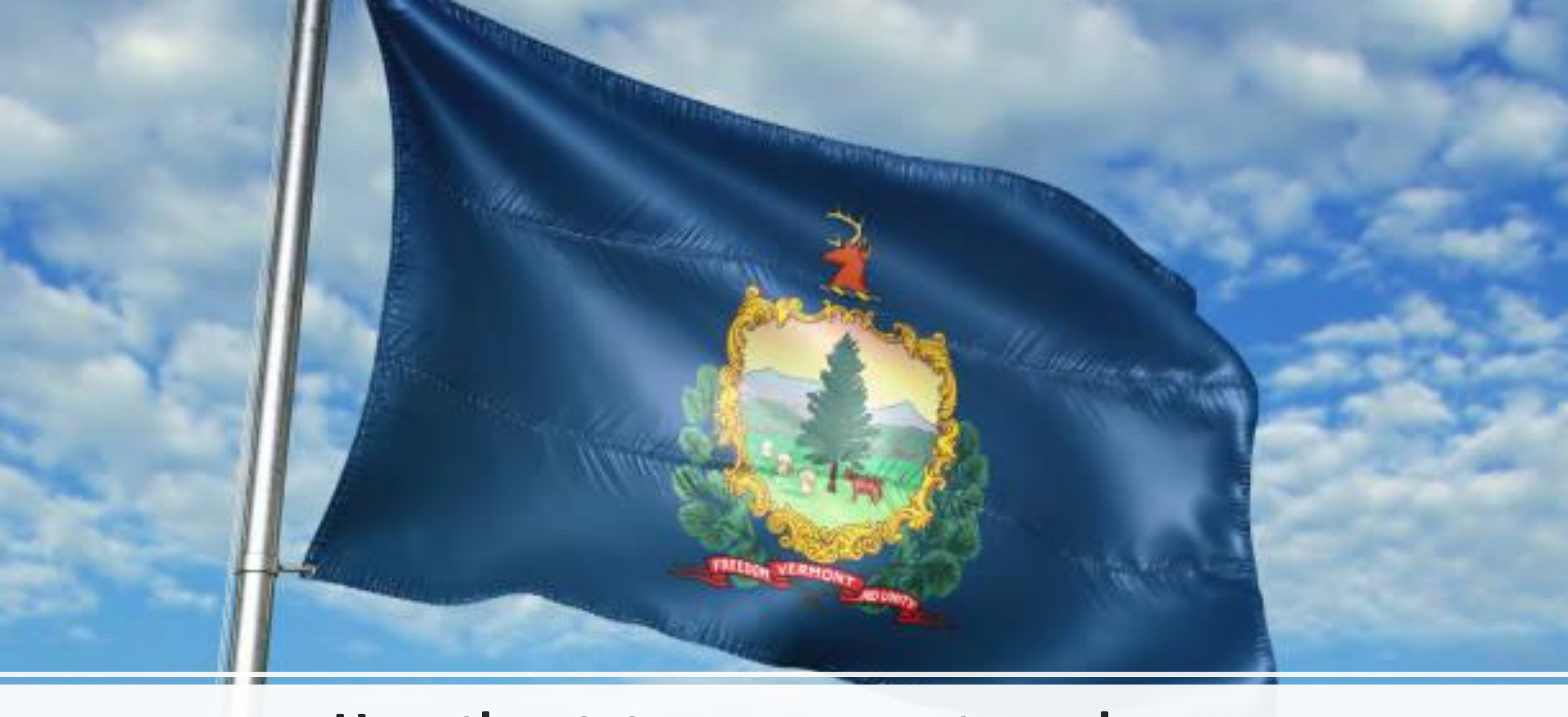
How the state can support employers