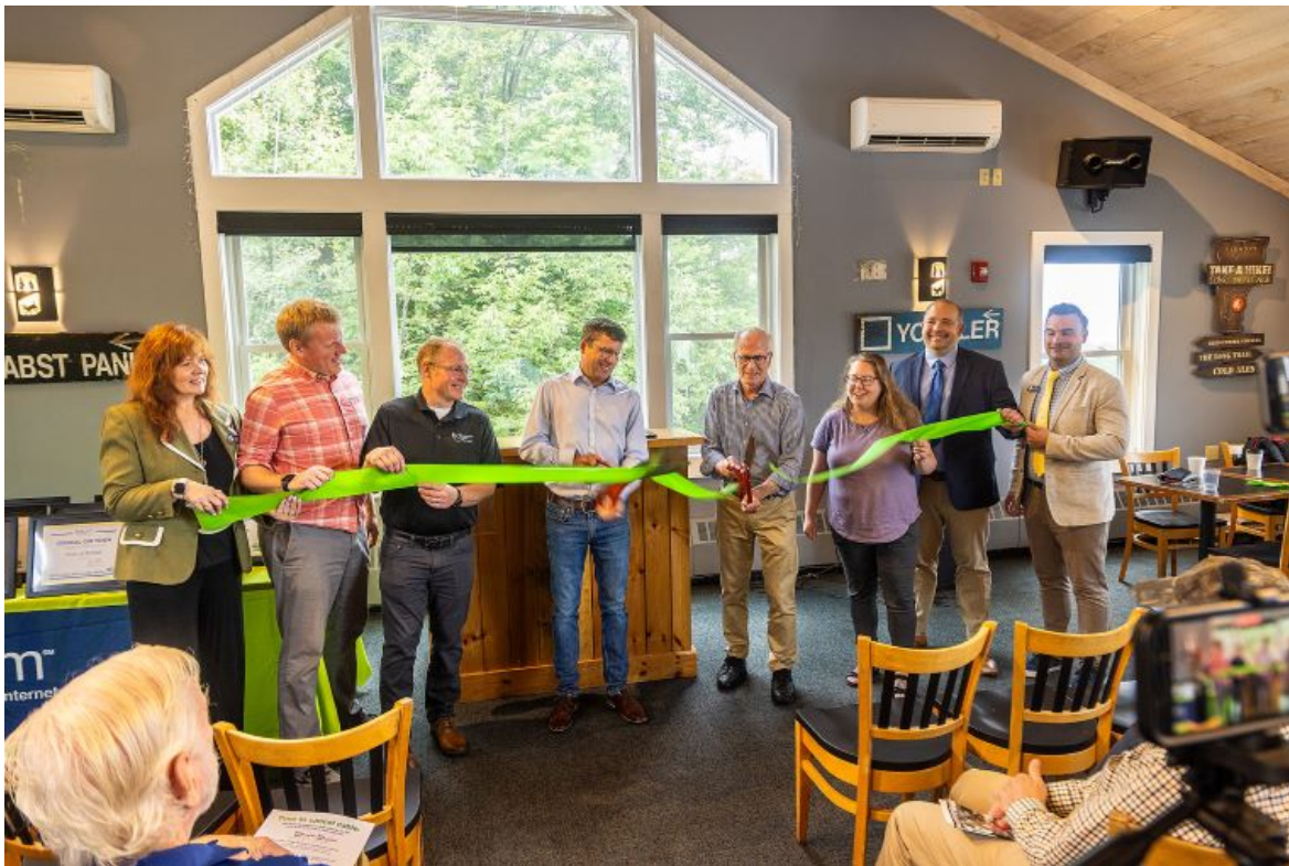
Southern Vermont CUD Ribbon-Cutting at Bromley Mountain with US Senator Peter Welch. Peru VT, August 2023

best practices related to the development of affordable housing and made recommendations for how housing should be considered as part of the redevelopment plan of a 307-acre parcel recently acquired by the Town. Results were presented to the Dorset Selectboard.