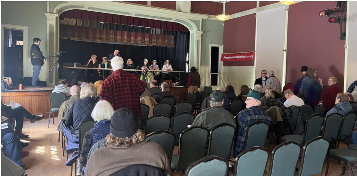
Jamaica, VT Town Meeting 2023

Investment in regional economic development continues to grow. Each year, voters in the 27 Windham Region towns are asked to invest in SeVEDS. In 2023, funding was approved by voters in Athens, Brattleboro, Brookline, Dover, Dummerston, Guilford, Halifax, Jamaica, Londonderry, Marlboro, Newfane, Putney, Readsboro, Rockingham, Stratton, Townshend, Wardsboro, Weston, Whitingham, Wilmington, and Winhall. These 19 towns represent over 80% of regional residents. Municipal support is matched with philanthropic, private, state, and federal dollars as well as BDCC revenue. Towns will provide $138,000 to fund FY '23 programs, nearly doubling BDCC's baseline state funding as a regional development corporation. Over the last five years, town funds helped launch BDCC Paid Internships, P3 high school career education, workforce development and attraction, and now Welcoming Communities programs. Town funds match USDA investment to provide programs serving communities directly: the Southern Vermont Economy Project (SVEP) and Community Facilities Technical Assistance Program (TAP).